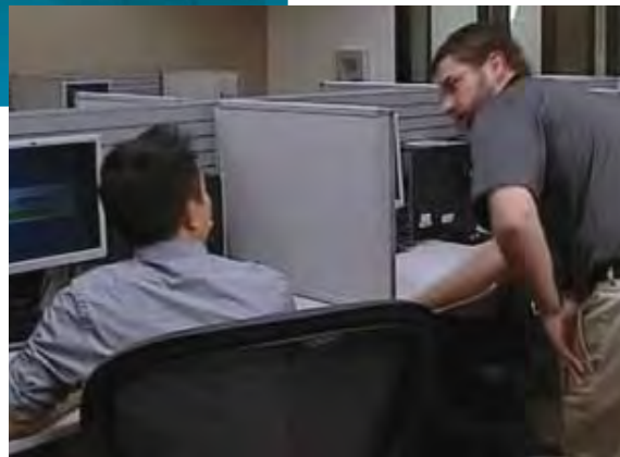
ASE is expanding its computer-based testing to more than 300 sites in July. By 2012, the transition to CBT will be complete. The CBT platform offers 21 st century speed and flexibility while maintaining familiar ASE test questions.

In turn, going the CBT route offers ASE a faster, more accurate means of administering and scoring your certification tests, which helps keep costs down.